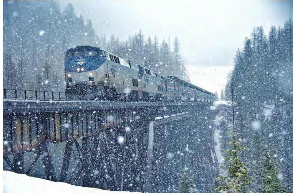
Amtrak train crossing a bridge in the mountains while snow is falling.